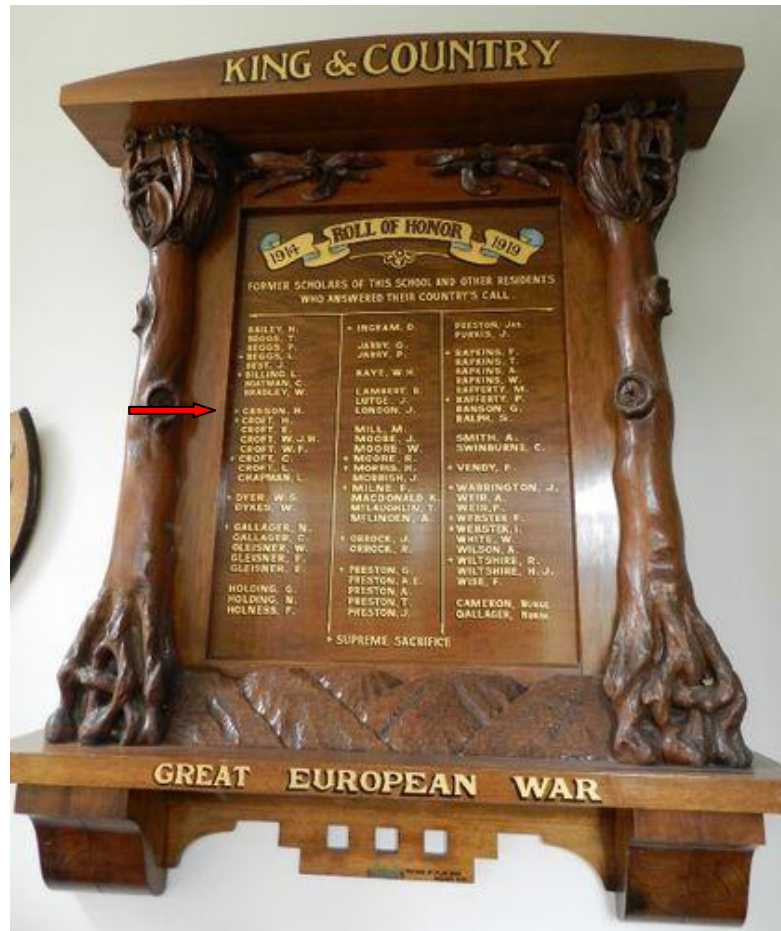
Elmhurst State School Honour Roll