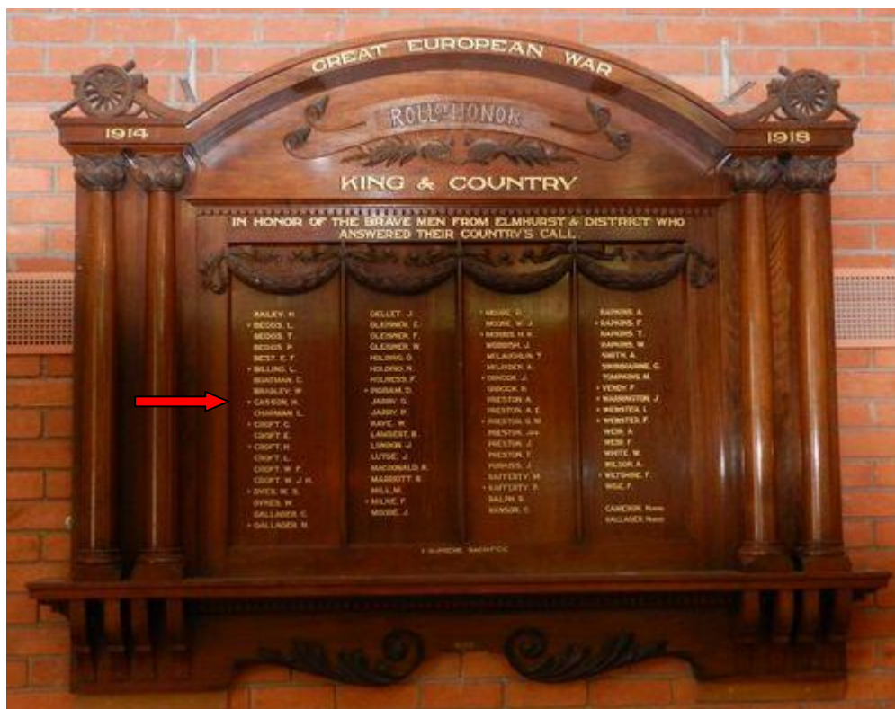
Elmhurst & District Honour Roll