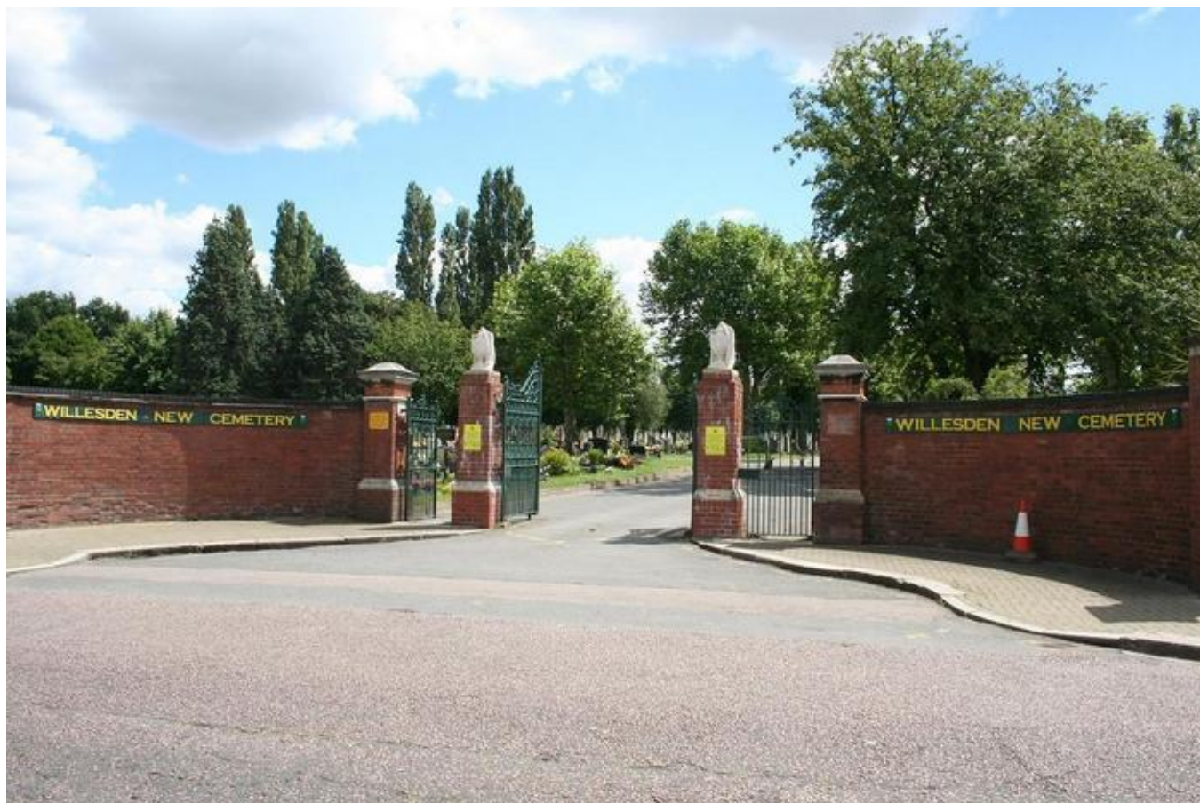
Willesden New Cemetery