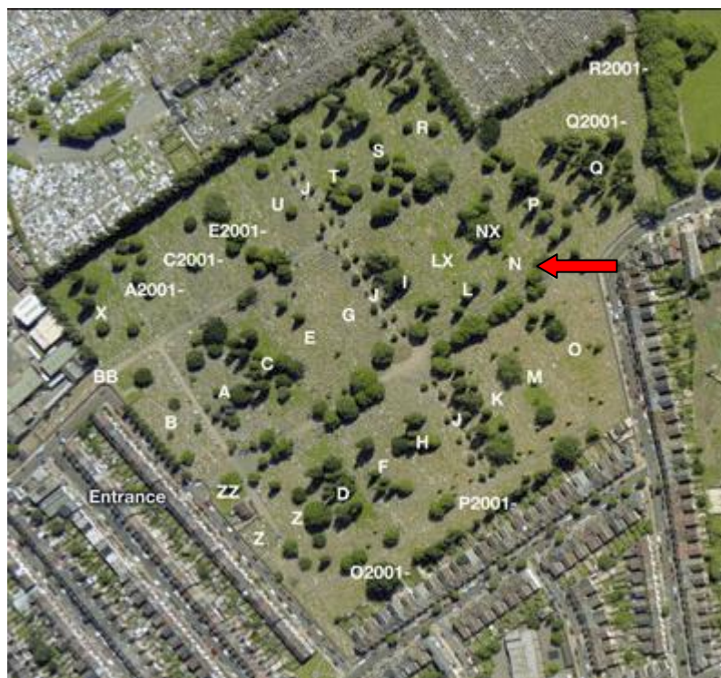
Map of Willesden New Cemetery