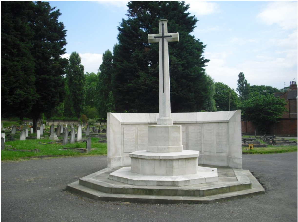
Cross of Sacrifice in Willesden New Cemetery